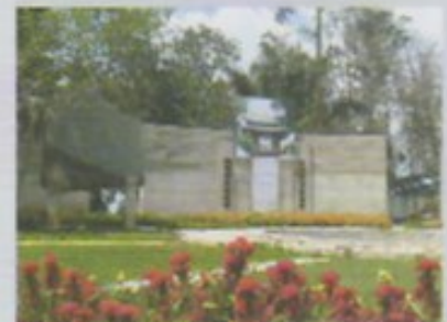
"Independence Declaration" spice