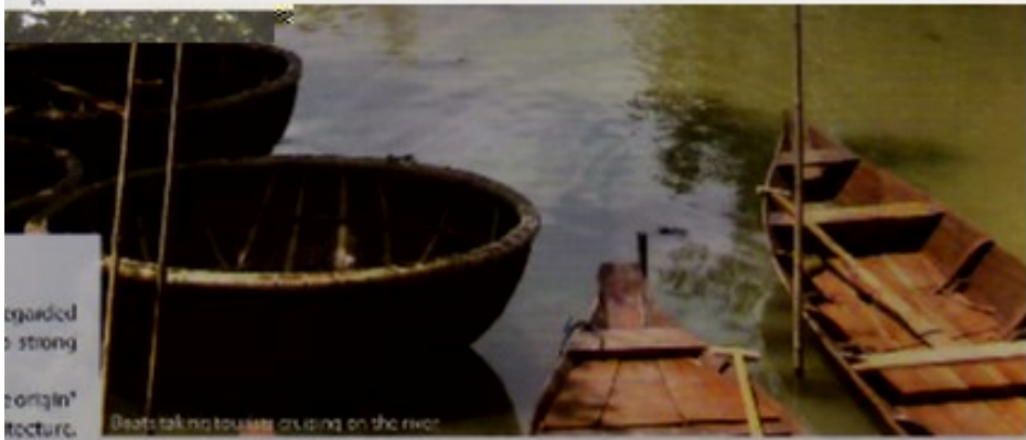
Boats taking tourists cruising on the river

guided strong origin' ecture. tures of Son to s under 980s, by 1418 k pots, s which sive at ion and as built d water rough n piles